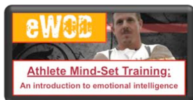
EWoD: Emotional Workout of the Day