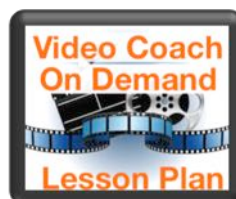
Video Coach on Demand