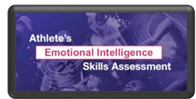
Emotional Intelligence Profile with custom development plan